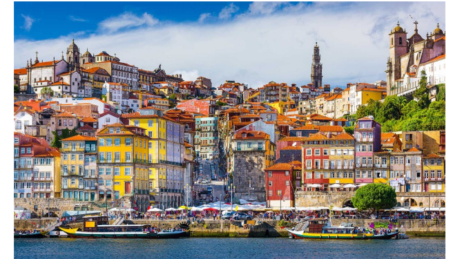
The 8th district urban cultural policy in Budapest